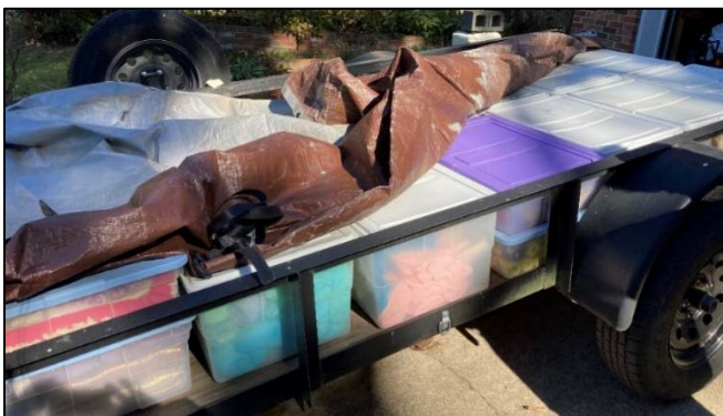
Trailer of donated yarn!