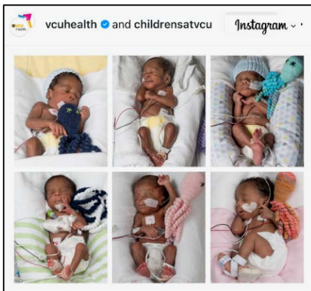
(Photo left) The adorable babies are holding octopuses made by From the Heart volunteers.