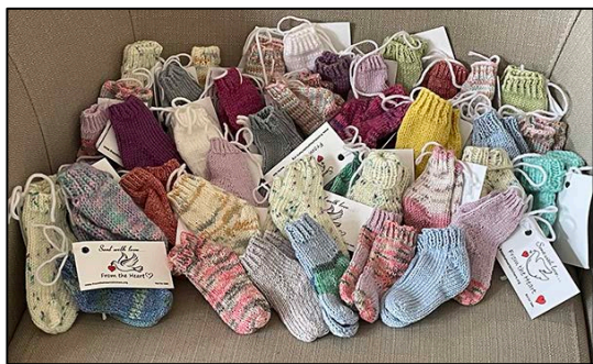
(Photo left) Thank you, São B. , for making 50 baby socks/booties for FtH! We are so fortunate to have so many wonderful volunteers who always step up when much-needed items are requested.